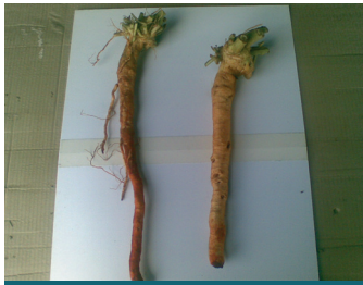
Treated - larger roots