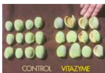
Better size & quality pistachios with Vitazyme.