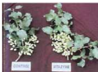
Superior nut set & leaf development for pistachios with Vitazyme.