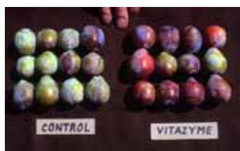
Better quality plums with Vitazyme.