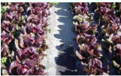
Vitazyme on left showing brighter colours and larger leaf with 1 treatment at transplant