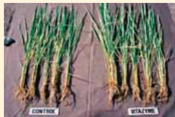
Vitazyme treated wheat shows excellent stalk strength, heading, leaf development and disease resistance.